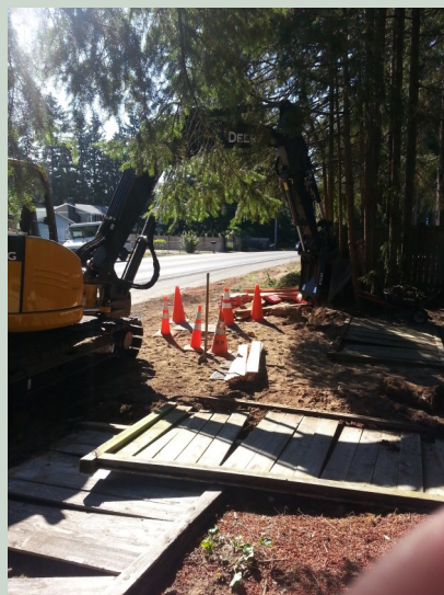
Water main replacement at 124th St E

Fruitland Mutual Water invites members to attend the annual board meeting on Thursday February 16, 2017.