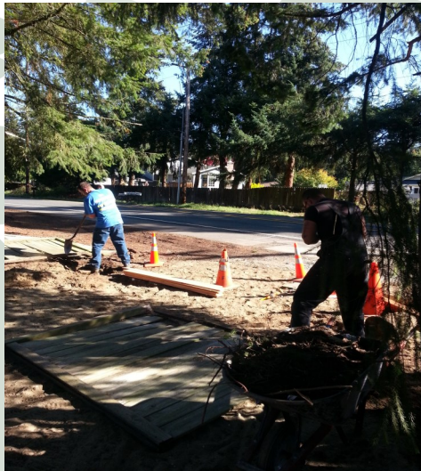
Water main replacement at 124th St E

Each year Fruitland Mutual Water Company members elect several board of directors from a slate of candidates. These candidates may be new or may be existing board members seeking reelection. If you would like to serve on the board for the Fruitland Mutual Water Company, or have a candidate to nominate, please send the candidate's name to our office. Candidate's must be members of the Fruitland Mutual Water Company in order to qualify. Before submitting a nomination, it is required that you have the candidate's permission and signature of two other Fruitland Mutual Water Company members for validation. Please include a brief biography and qualifications of the person nominated. To give the nomination committee time for preparation of the ballot, please submit your nominations as early as possible. Proposals for bylaw changes will be received for review by the Board of Directors. Proposed changes must be accompanied by signatures of at least two members. All nominations and proposals must be received at the Company office (4001 9th St SW) no later than 4:30pm on January 3rd, 2017.